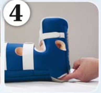
4 Test the fit under heel opening. Boot should not move on the leg.