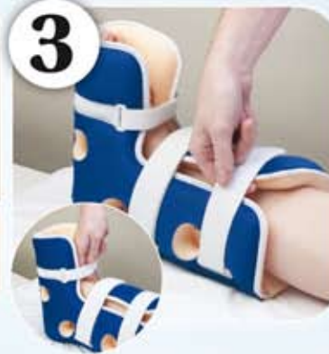
3 Test the fit under straps. APPLY STRAPS LOOSELY.