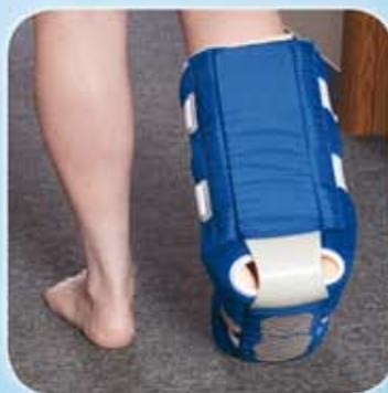
Non-slip sole aids with assisted ambulation.