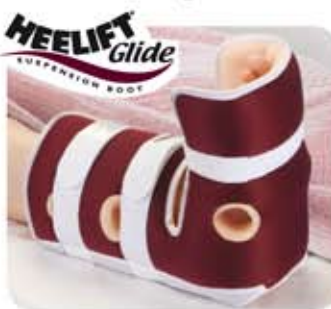
Heelift® Glide Boot www.heeliftglide.com