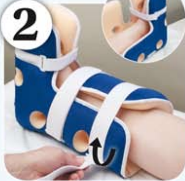
2 Thread straps through D-rings. Secure the straps.