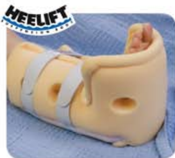
Heelift® Suspension Boot www.heelift.com