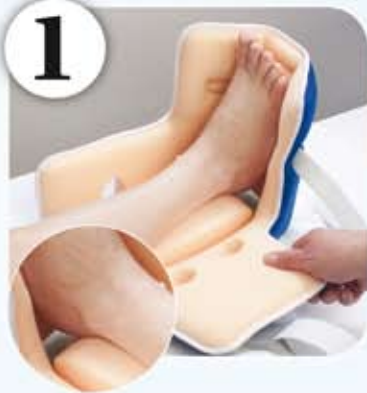
1 Place foot inside boot with the heel above the opening.

Available in multiple languages at: http://www.heelift.com/heelift-instructions.html