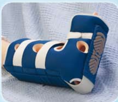
Semi-rigid brace keeps the ankle and foot in position.